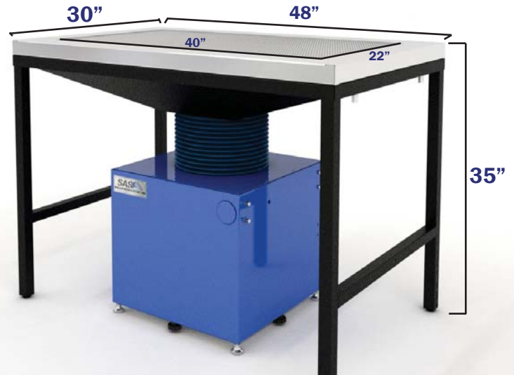
Dimensions are Approximate