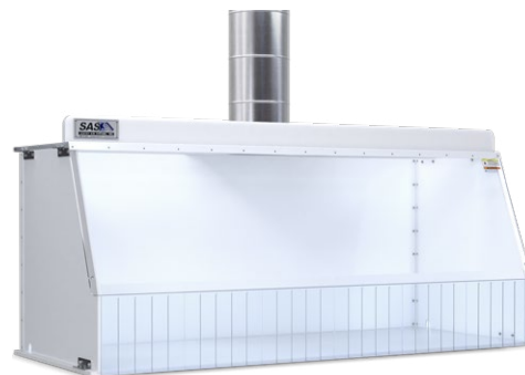
60" Ducted Fume Hood