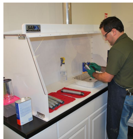
Ducted Fume Hoods provide fume extraction for various applications (50" pictured).