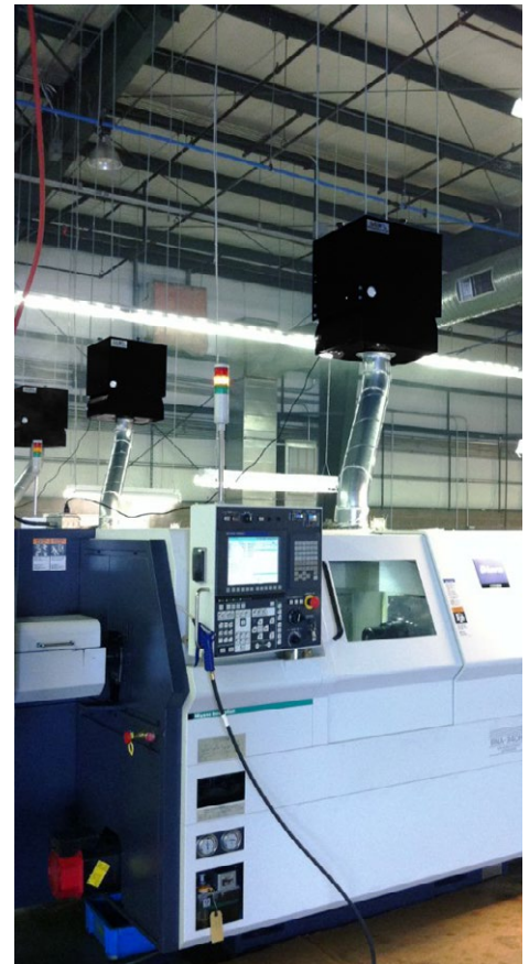
Model 450 Mist Collector installed on a CNC machine