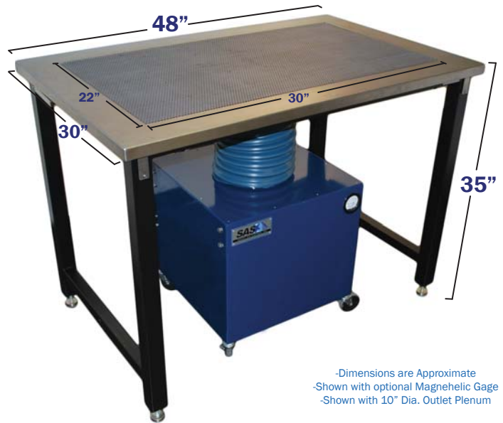
-Dimensions are Approximate -Shown with optional Magnehelic Gage -Shown with 10" Dia. Outlet Plenum