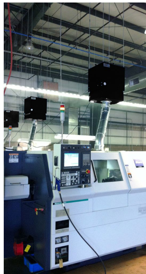
Model 400/450 Mist Collector installed on a CNC machine.