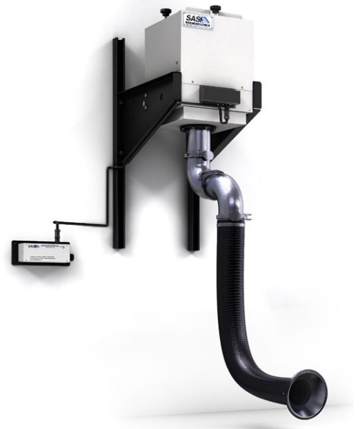
Model 300 Sky Sentry Fume Extractor (Shown with optional filter cover)