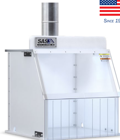
18" Ducted Fume Hood