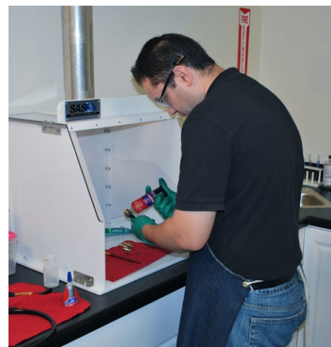
Ducted Fume Hoods provide fume extraction for various applications.