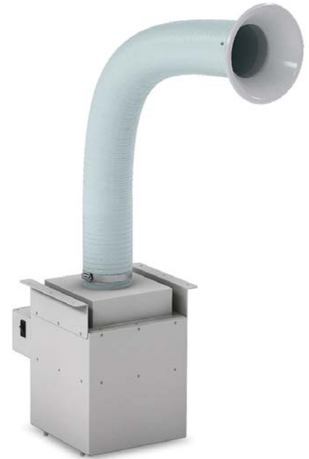
Model 200/225 Mounted Single Sentry

A larger model [SS-300-MSS] and a dual-arm unit [SS-200/225-MSD] are also available.