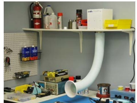
Model 200/225 Mounted Single Sentry easily mounts on the wall to free up benchtop space.