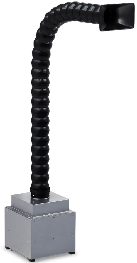
Model 100 Stainless Steel Floor Sentry

The Stainless Steel Floor Sentry offers an effective, quiet, and economical ESD-safe fume extraction solution for many benchtop soldering operations. ESD-safe solutions help prevent electrostatic discharge while soldering to help protect expensive electronic media. All of Sentry Air's products are proudly manufactured in the United States and are backed by our two-year limited warranty on parts and labor.