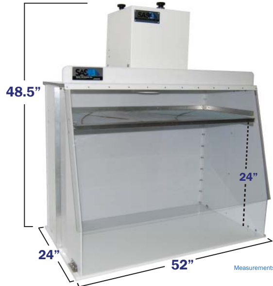
Measurements are approximate.

Limited two-year warranty from date of shipment on defects due to materials or workmanship. PATENT #5,843,197