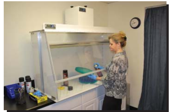
60" Wide Ductless Spray Booth Pictured Above