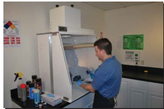
30" Wide Ductless Spray Booth Pictured Above