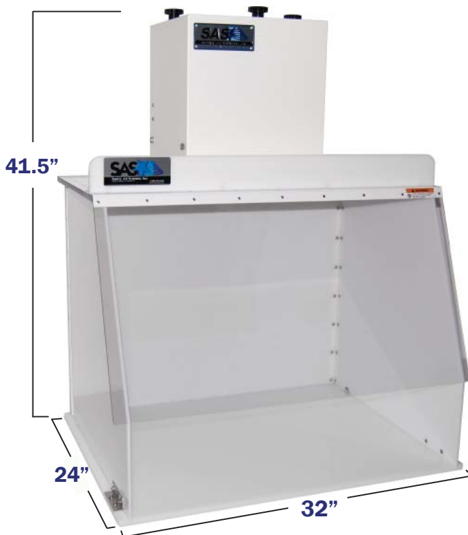
Shown with outer dimensions. Measurements are approximate.

Limited two-year warranty from date of shipment on defects due to materials or workmanship. PATENT #5,843,197