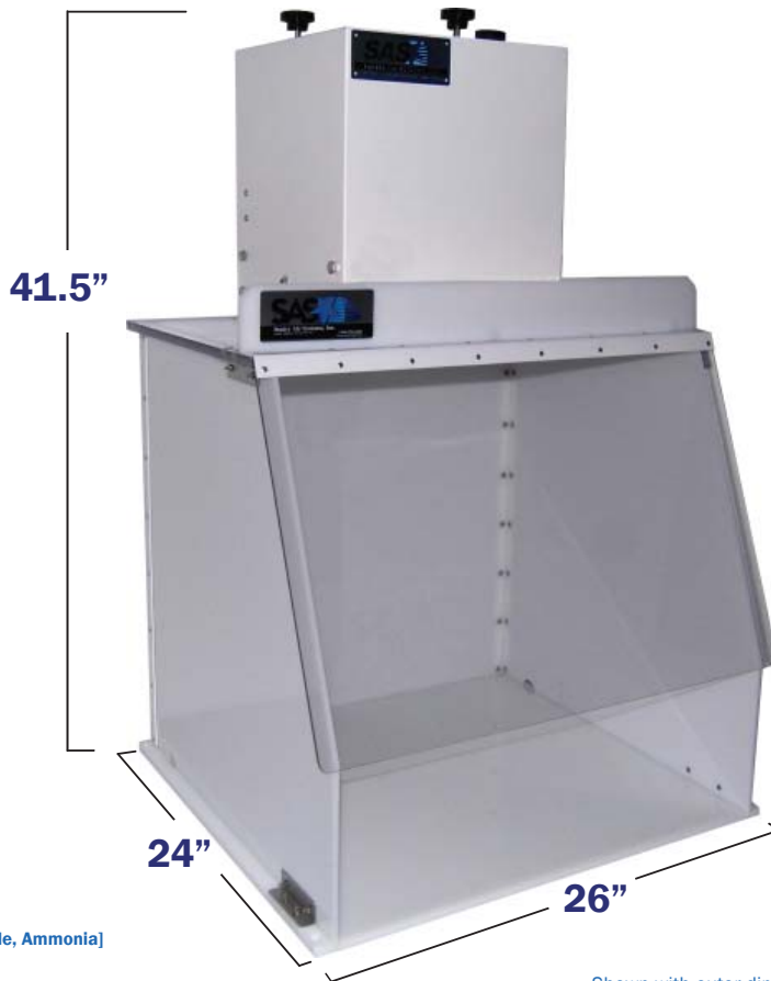
Shown with outer dimensions. Measurements are approximate.

Limited two-year warranty from date of shipment on defects due to materials or workmanship. PATENT #5,843,197