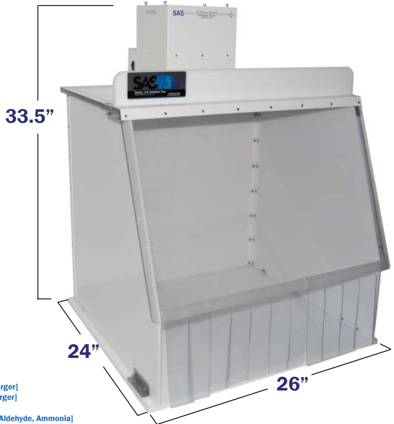
Shown with outer dimensions. Measurements are approximate.

Limited two-year warranty from date of shipment on defects due to materials or workmanship. PATENT #5,843,197