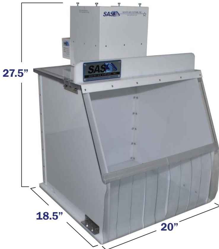
Shown with outer dimensions. Measurements are approximate.

Limited two-year warranty from date of shipment on defects due to materials or workmanship. PATENT #5,843,197