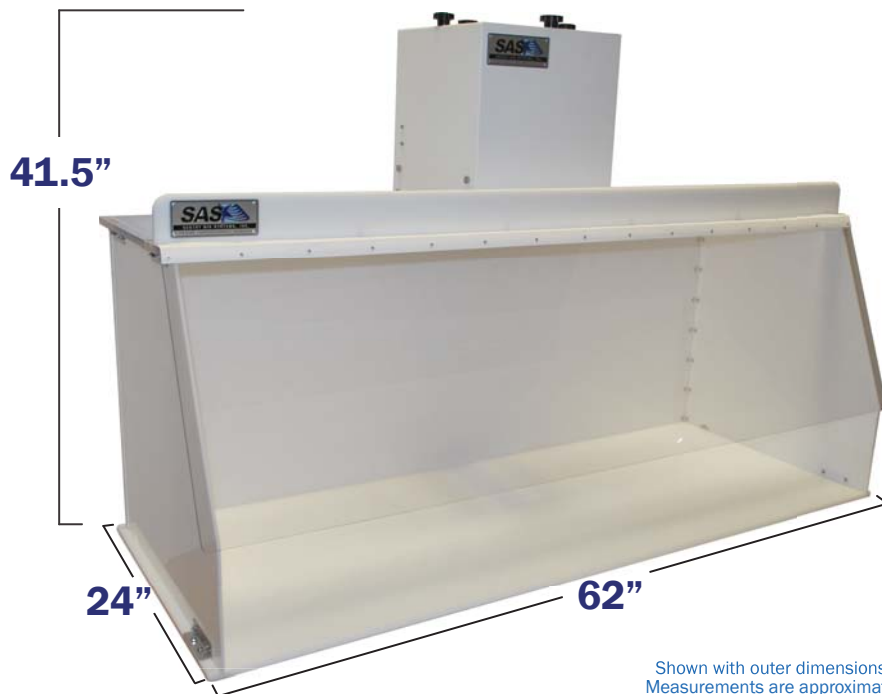
Shown with outer dimensions. Measurements are approximate.

Limited two-year warranty from date of shipment on defects due to materials or workmanship. PATENT #5,843,197