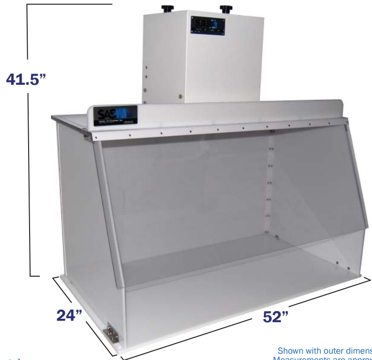
Shown with outer dimensions. Measurements are approximate.

Limited two-year warranty from date of shipment on defects due to materials or workmanship. PATENT #5,843,197